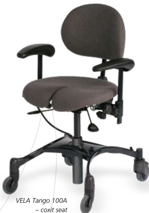
VELA Tango 100A – coxix seat

The VELA Tango range boasts outstanding flexibility as the chairs can be adapted to meet individual needs and wishes with regard to seat, back and armrests. There is also a choice in fabric.