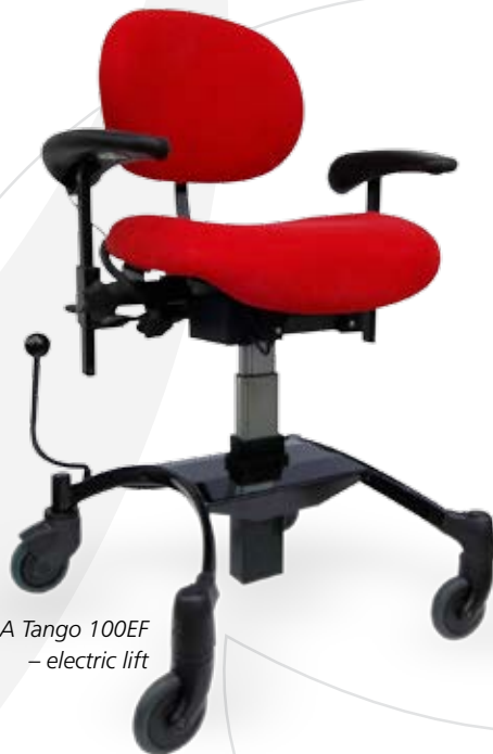
VELA Tango 100EF – electric lift