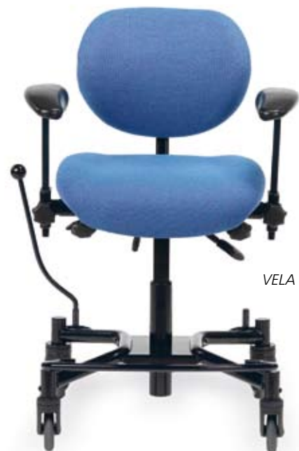
VELA Tango 50 – gas lift