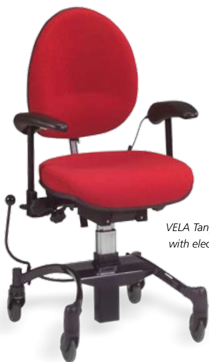
VELA Tango 200EF with electric lift