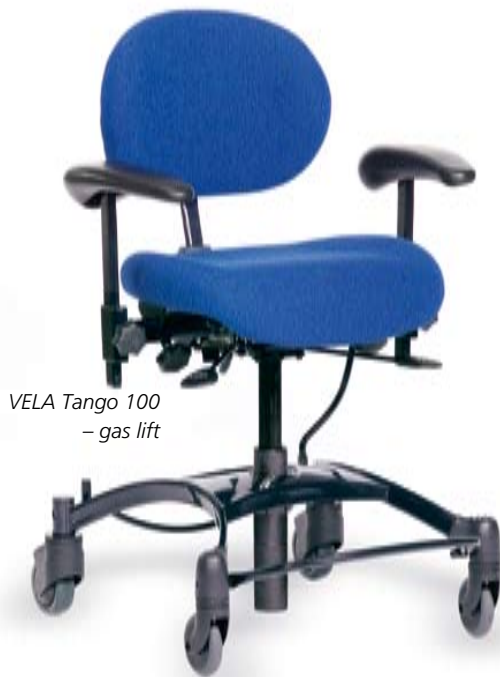
VELA Tango 100 – gas lift

As people are individuals and have different needs, it is completely natural that VELA supplies products that meet the unique wishes and requirements of individual users.